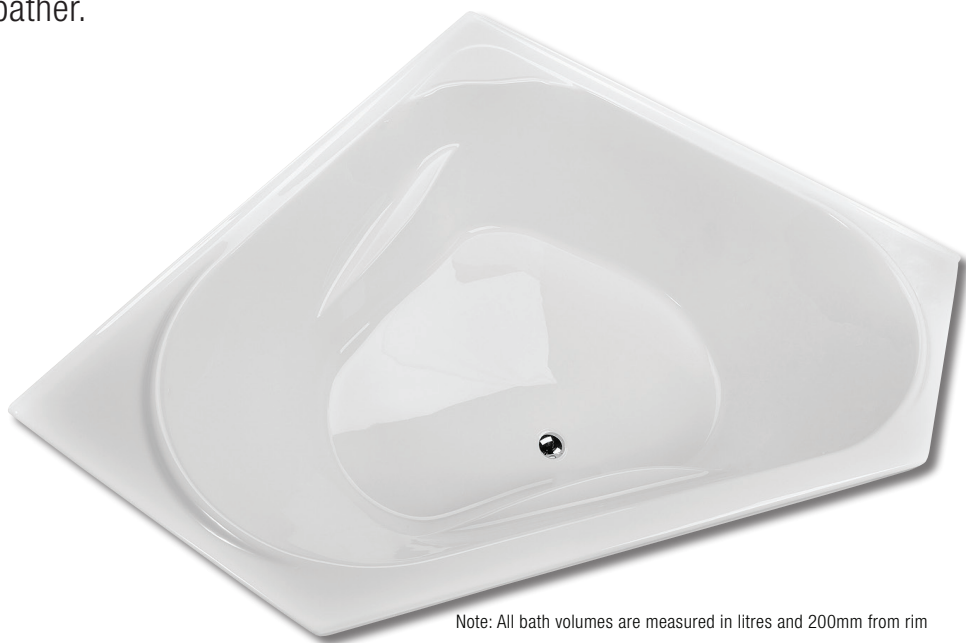
Note: All bath volumes are measured in litres and 200mm from rim

Larger bathrooms have opened up the possibilities for corner designed baths and the Angelique in two functional sizes is perfect for this application. Careful attention has been paid to the reclining angles to provide full back support to the bather.